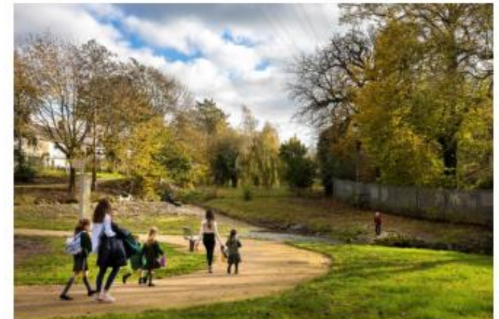
Community members using the Connswater Community Greenway